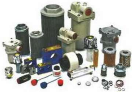
ALL TYPE OF ACCESSORIES