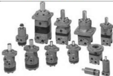
ORBITAL HYDRO MOTOR