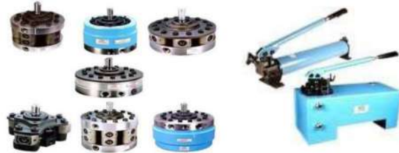
PISTON PUMP & HAND PUMP