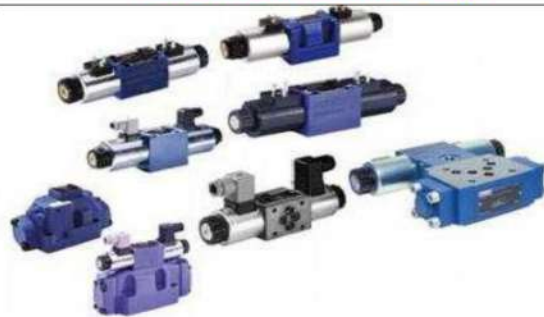
SOLENOID DIRECTION VALVE