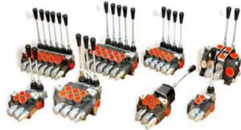
MOBILE CONTROL VALVE